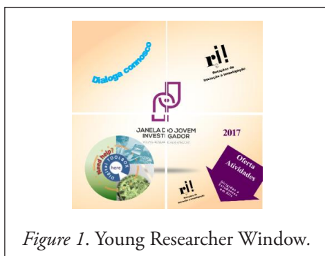
Figure 1. Young Researcher Window.

Research Initiation Rotations → next edition: 2018/2019 academic year