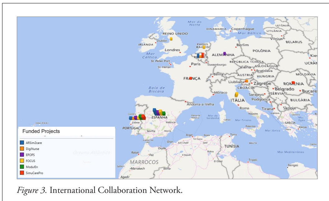
Figure 3. International Collaboration Network.

La simulation en santé pour développer un partenariat entre apprenants et professionnels dans la formation médicale et paramédicale (SimuCarePro) → 4 countries → 5 organizations → 11 researchers