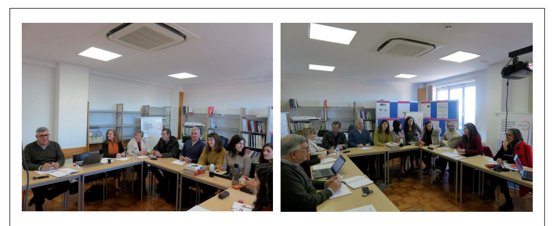
Figure 2. 1st 2019 RESEARCH WORKSHOP.

1^{\text{st}} 2019 RESEARCH WORKSHOP - Short presentations by master's students (11/01/2019)