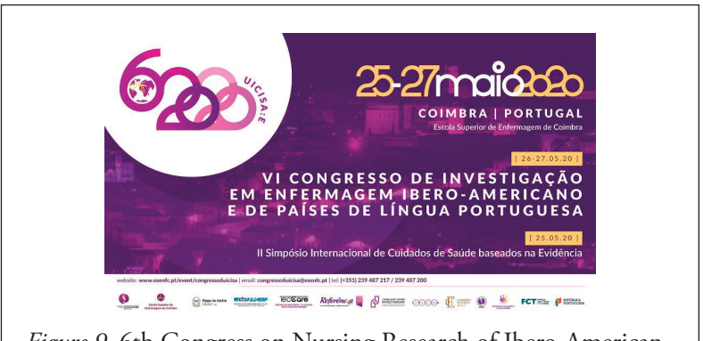
Figure 9. 6th Congress on Nursing Research of Ibero-American and Portuguese-speaking Countries.

\rightarrow 25 May 2020 - 6<sup>th</sup> Congress on Nursing Research of Ibero-American and Portuguese-speaking Countries and 2<sup>nd</sup> International Symposium on Evidence-Based Health Care.