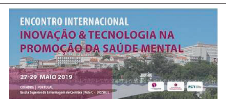
Figure 8. International Meeting Innovations & Technology in Mental Health Promotion.

\rightarrow 27-29 May 2019 - International Meeting Innovations & Technology in Mental Health Promotion