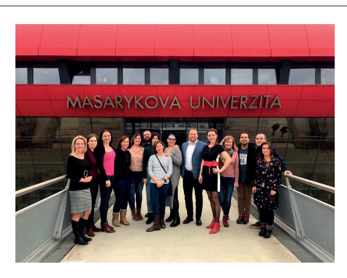
Figure 5. Participants of the JBI Evidence-based Clinical Fellowship Program (EBCFP) in Brno, Czech Republic.