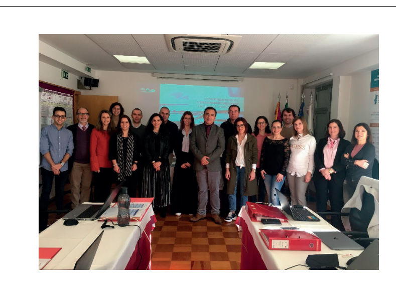
Figure 6. Participants of the 10th CSRTP.

The participants came from Portuguese educational and health institutions.