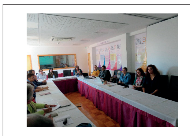
Figure 3. 4^{\rm th} RESEARCH WORKSHOP - Short presentations of master's students