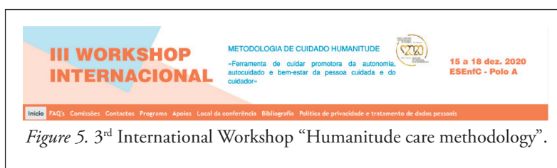
Figure 5. 3 rd International Workshop “Humanitude care methodology”.