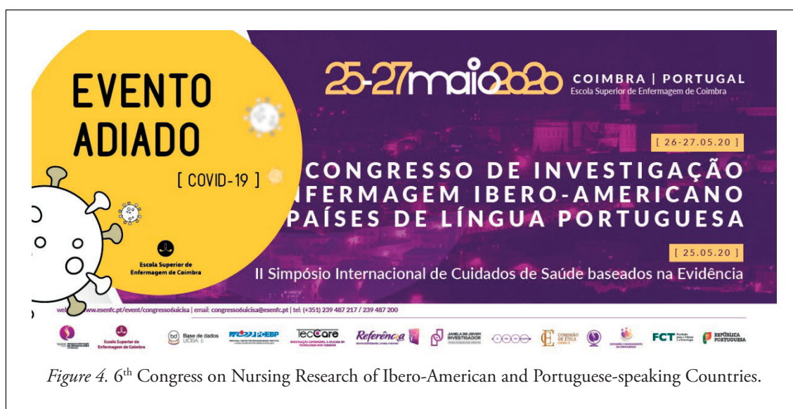
Figure 4. 6 th Congress on Nursing Research of Ibero-American and Portuguese-speaking Countries.