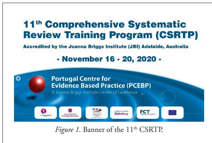
Figure 1. Banner of the 11 th CS RTP.

Registrations on: http://www.esenfc.pt/event/jbiportugal2020