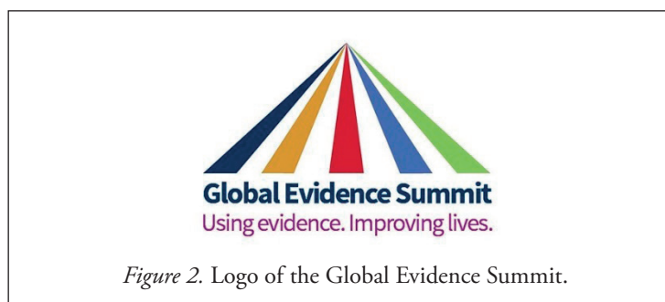
Figure 2. Logo of the Global Evidence Summit.

For more information: https://www.globalevidencesummit.org/