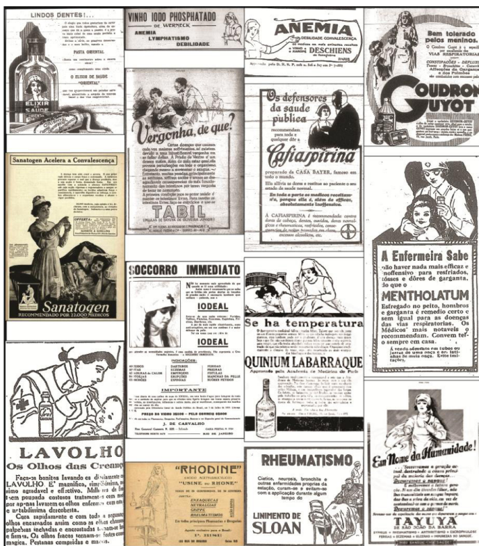
Figure 1. Medication advertisements with female images wearing female nurses' uniforms (1916-1931), featured in the pages of the Fon-Fon Magazine.

In the 148 editions searched, 14 types of medication advertisements with images were found, including personal attributes of female nurses in the Fon-Fon magazine, in the period from 1916 to 1931, in a total of 248 images with these attributes (Figure 1).